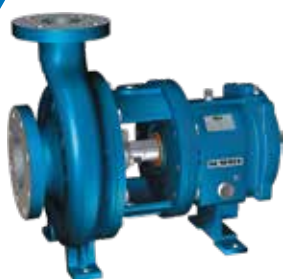
ROTATING EQUIPMENT DIVISION