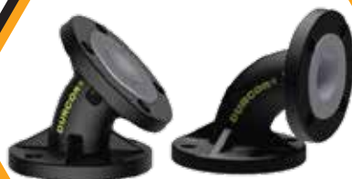
CORROSIVE FLUID HANDLING DIVISION